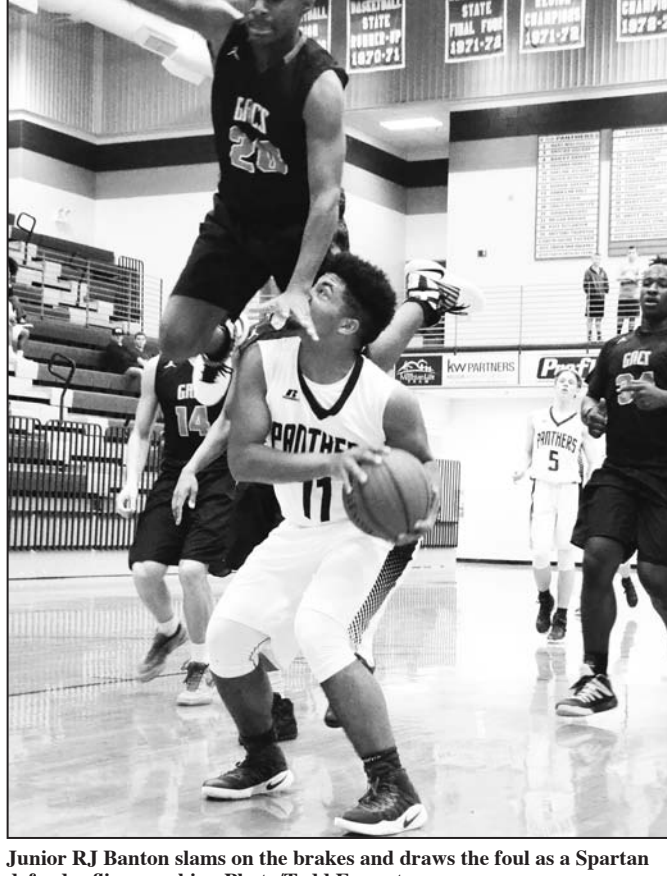
defender flies over him.

The first quarter opened with very little defense asboth squads exchanged lay-ups over the first five minutes of action. Union would take a 13-12 lead after Banton converted an offensive board into points with 3:28 to play in the period, but both sides went ice cold and wouldn't score again until the second quarter.